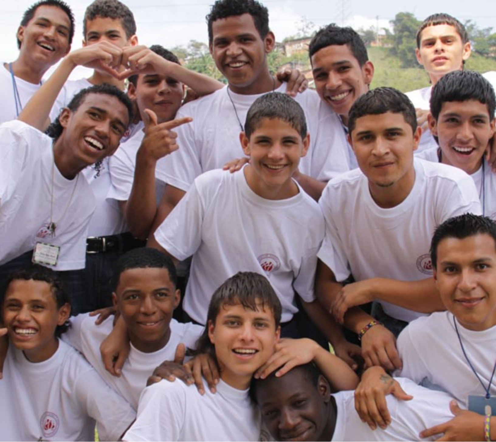
Lower Dropout Rates